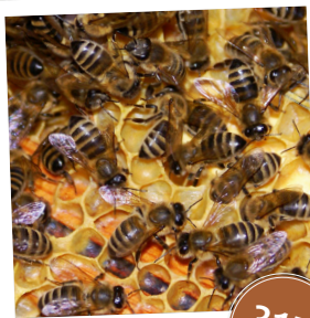
* Two beehives