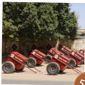
* Tank and draft animal

Through your donations, we provide an opportunity for needy individuals to produce honey and exercise the profession of beekeeper.